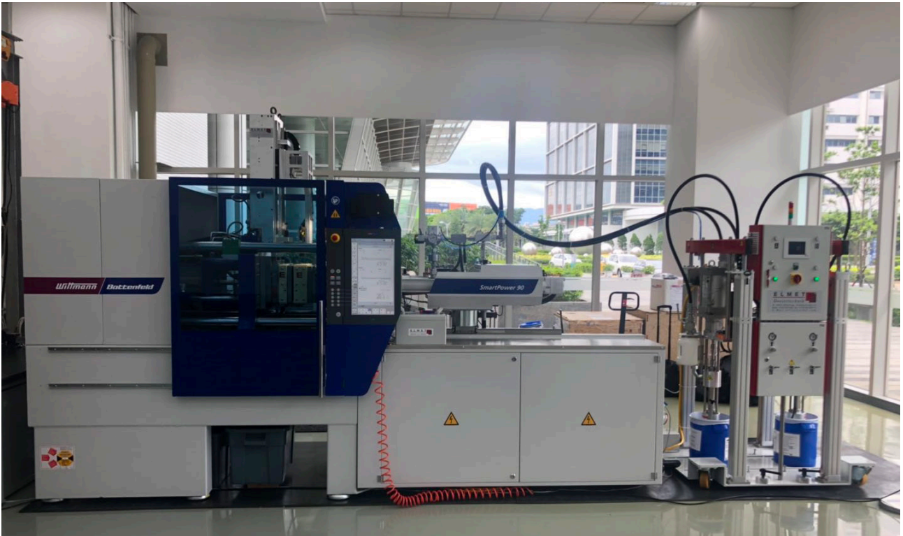
圖二：威猛巴頓菲爾射出成型機與 Elmet 供料機實機拍攝。